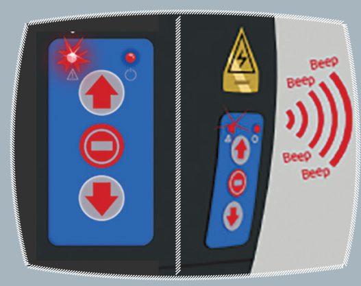
Battery warning light flashes

How to order replacement 3.6 2400mAh batteries: Visit www.batteryterminal.co.uk and use promo code QZ784Y for a 50% discount on replacement batteries. Batteries will be send direct with free next day delivery!