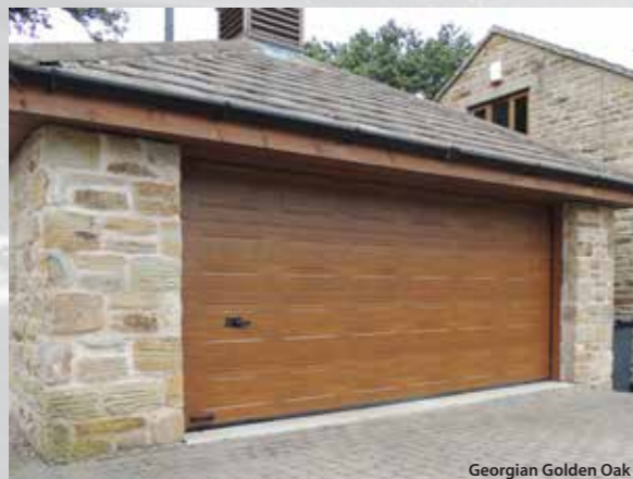
Georgian Golden Oak

Georgian styled panels provide a traditional alternative for a sectional door, enhancing the look of your home.