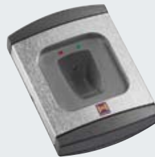
FL 12 / FL 100 finger-scan For 2 functions, to open the garage door via a fingerprint. Can store 12 or 100 fingerprints, respectively.