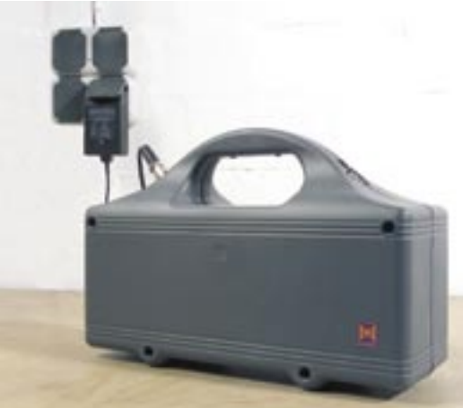
Power for up to 40 days Easy overnight recharging