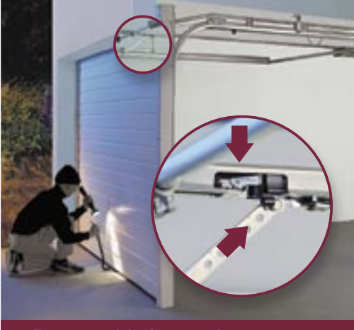
Boom-guided operation Patented door latching